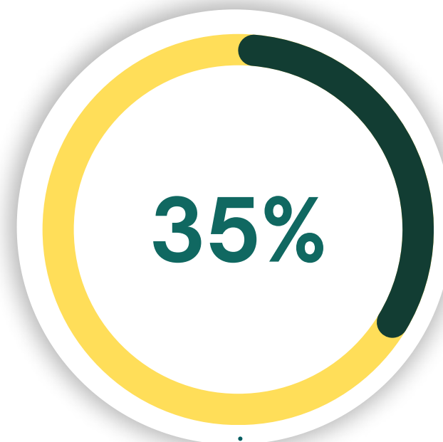
Increase in Customer Retention