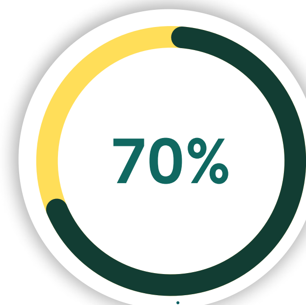
Reduction in Response Time