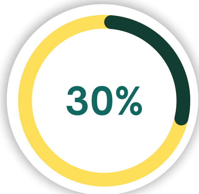
Increase in Conversion Rates